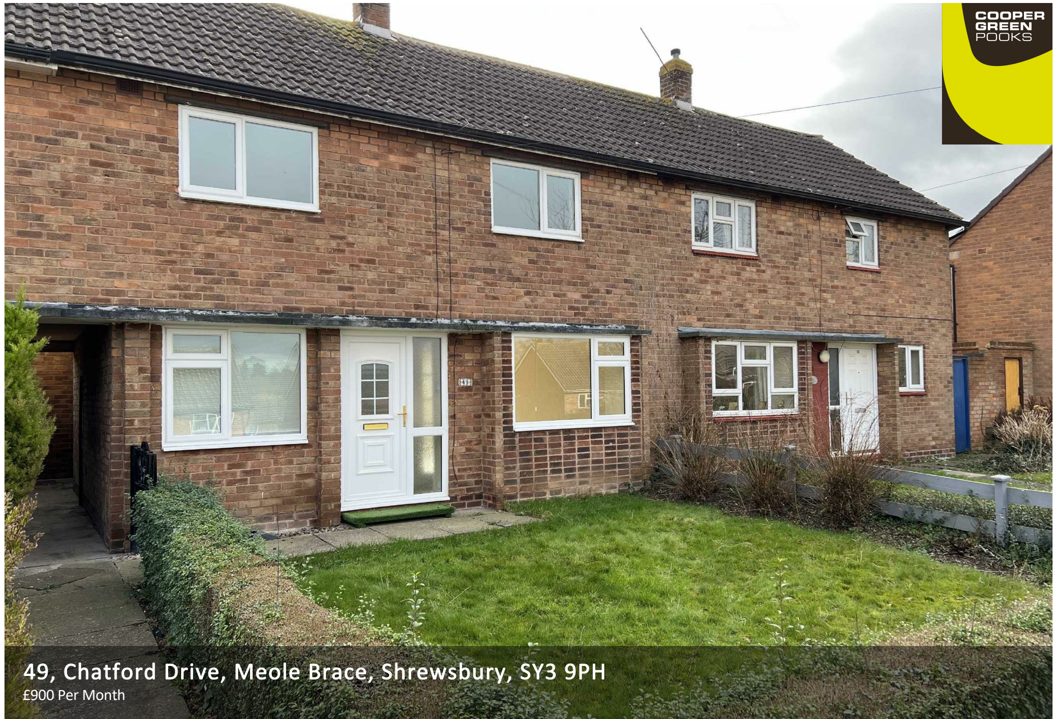
49, Chatford Drive, Meole Brace, Shrewsbury, SY3 9PH £900 Per Month